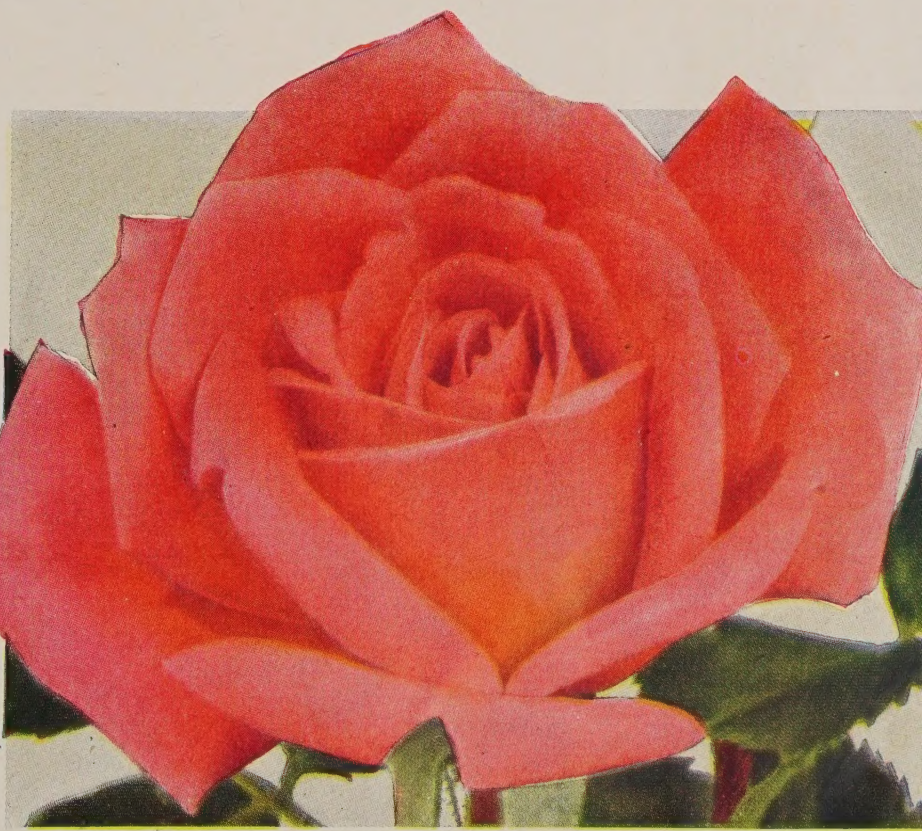
McGREDY'S SALMON—$1.50 each; 3 for $3.75 (Plant Patent No. 410)